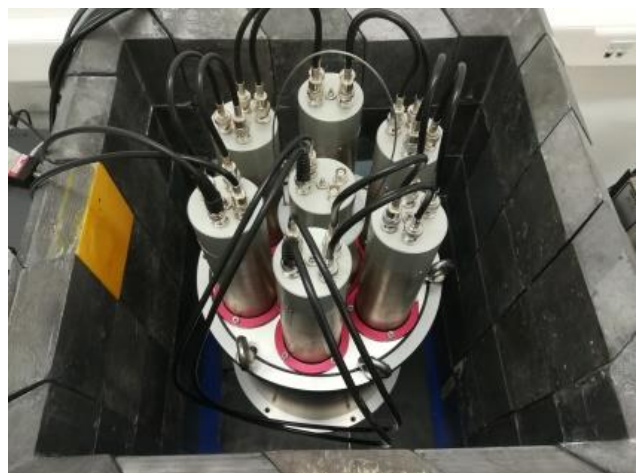
Figure 2 Compton Suppression Spectrometer